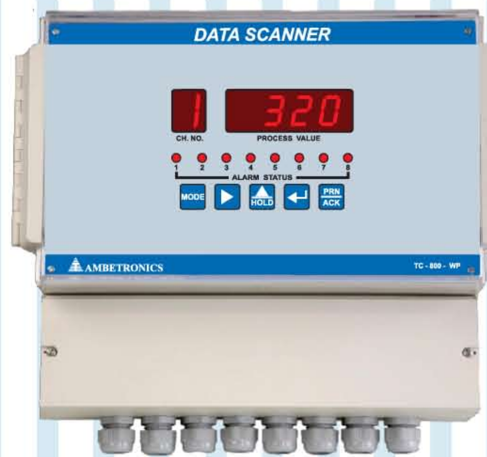
TC - 800 / TC - 800D - WP WEATHERPROOF