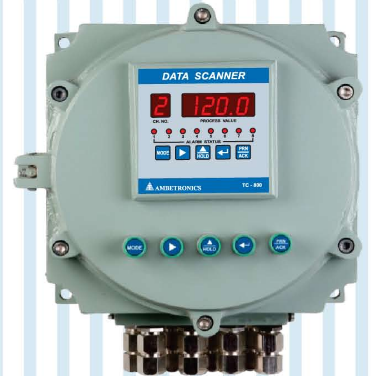
TC - 800 / TC - 800D - FLP FLAMEPROOF