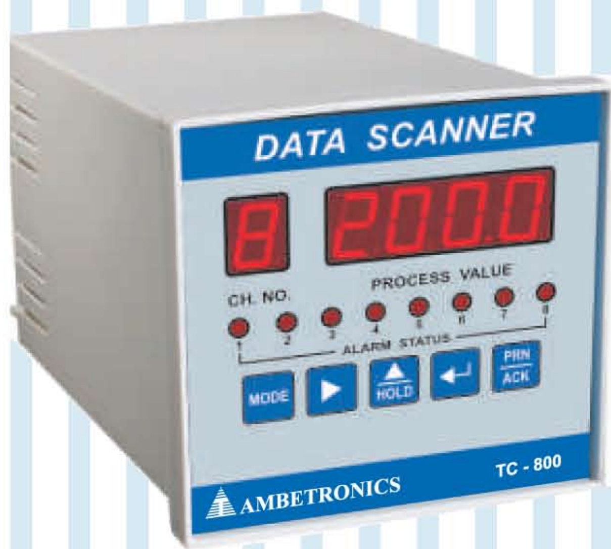
TC - 800 / TC - 800D PANEL MOUNT