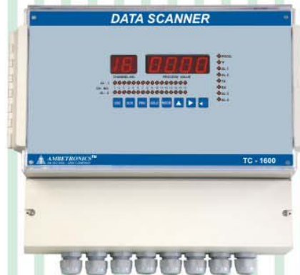
TC - 1600F / TC - 1600FD - WP WEATHERPROOF