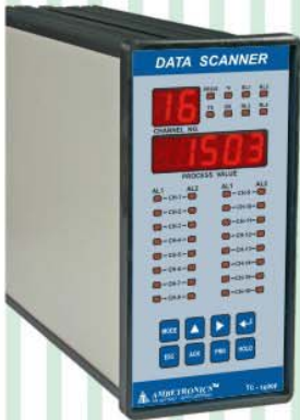
TC - 1600F / TC - 1600FD PANEL MOUNT