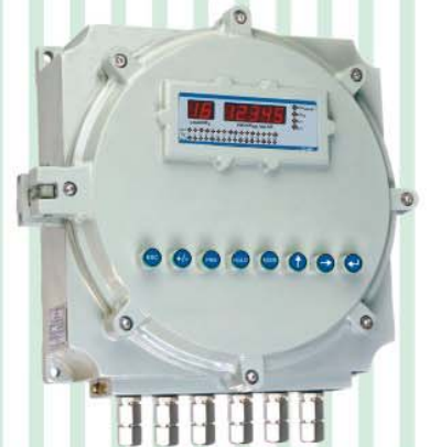
TC - 1600F / TC - 1600FD - FLP FLAMEPROOF